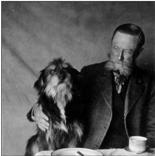
Figure 1. Bailey Willis with his dog "Feo" (c. 1912)

This year marks the 110th anniversary of one of the most important surveys carried out in relation to applied geology in northern Patagonia, central to the project works developed by Bailey Willis in the area during 1911–1913.