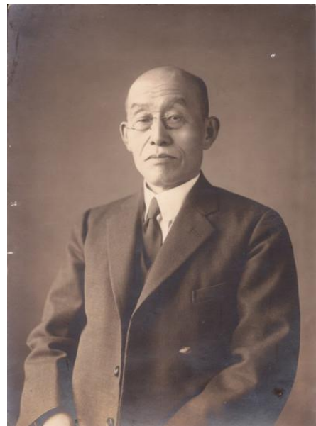
Figure 1. Takuji Ogawa (1870–1941).

While travelling to his home province in 1891 Takuji was surprised by the Great Nōbi Earthquake that took place on the 28 th October. As he observed the area of disaster in the Nōbi district on the one hand and the sublime beauty of nature along the Kii Peninsula on the other, the event made a deep impression upon the young man. After this experience he became determined to be a geologist in order to study the history and structure of the Earth.