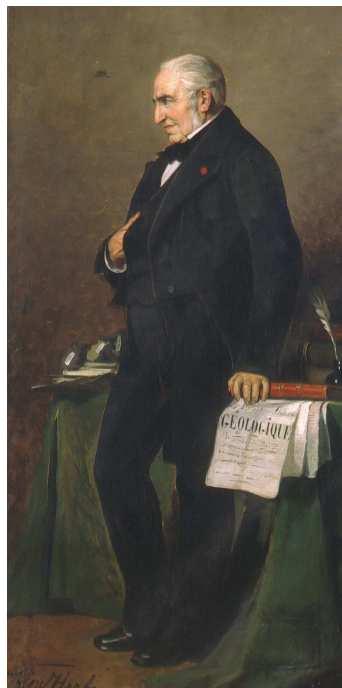
Fig. 1 Jean-Baptiste Julien d'Omalus d'Halloy. Portrait painting by Léon Herbo (1850–1907).

In 1822, the Annales des Mines published an Essai d'une carte géologique de la France, des Pays-Bas et de quelques contrées voisines , established by J. J. d'Omalus d'Halloy according to materials collected in concert with M. le Baron Coquebert de Montbret. The map, approximately at the scale of 1/4 000 000, represents the diversity of the geological terrains of the territory of the French Empire in 1810 by 6 flat tints (Omalus d'Halloy, 1822).