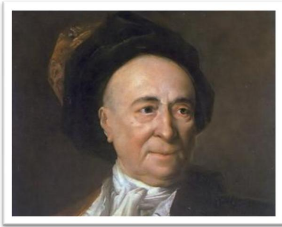
Figura 3 - Portrait of B. Le B. de Fontenelle. Detail from portrait by Nicolas de Largillière. From Wikimedia Commons. Musée des Beaux-Arts de Chartres.

Faithful to the Academy's dual obligation to advance knowledge and show its uses, Réaumur spent no less time in his report on the falun 's practical exploitation for agriculture than in describing it and discussing its possible scientific significance.