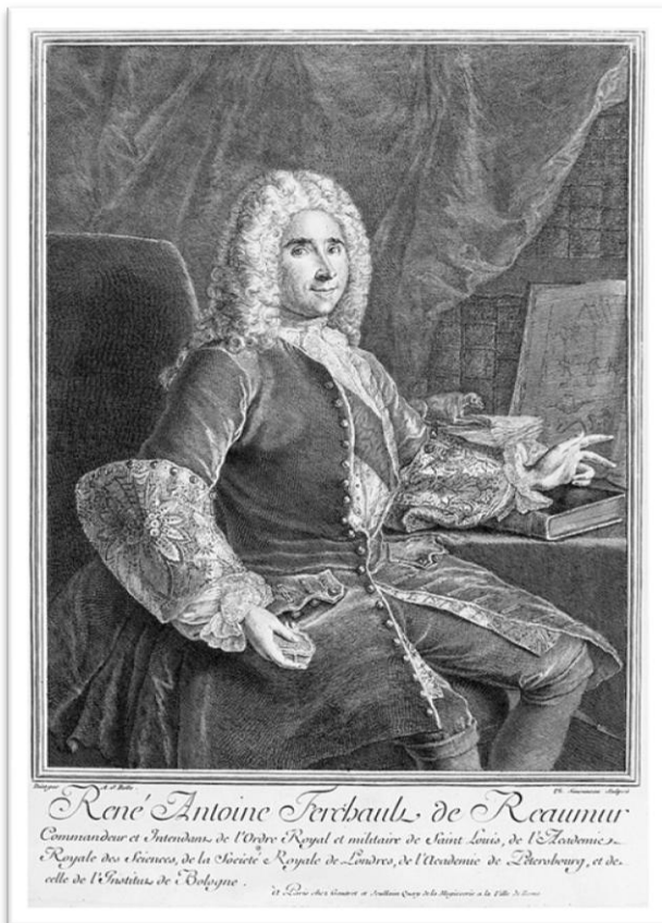
Figure 1 - Portrait of R. A. F. de Réaumur. Engraving by Philippe Simonneau, from painting by Alexis-Simon Belle.